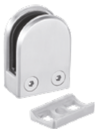
CLAMP 62 x 45mm Ref. 00086245-0812