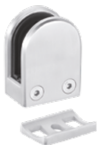
CLAMP 67 x 50mm Ref. 00086750-1218