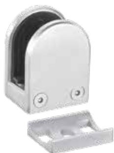
CLAMP 72 x 55mm Ref. 00087255-2126